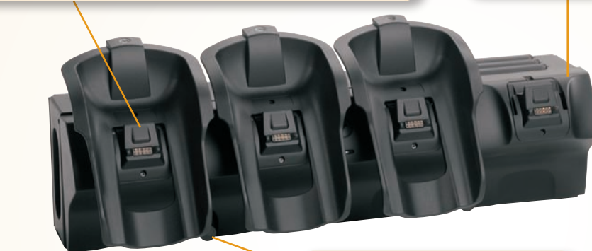
CRD9500-4000CR / CRD9500-4000ER

The standalone 4-bay cradle facing can be mounted as needed — on the wall in the backroom or on a desk.